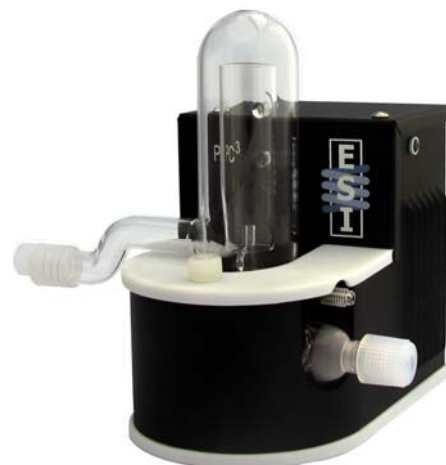
PC 3 with SSI spray chamber

Short term signal stability, 20 min analysis time n = 10