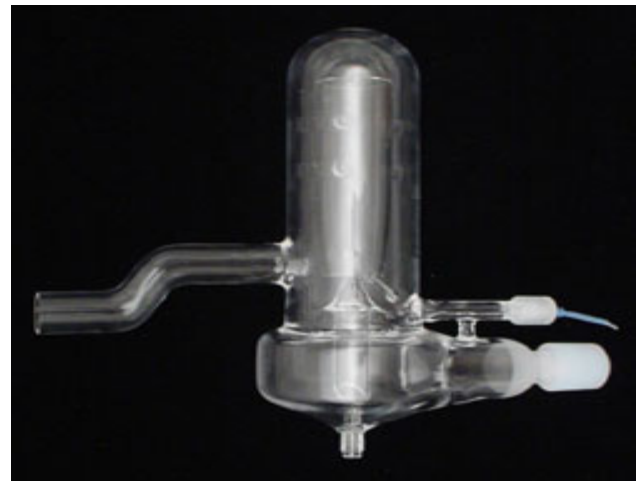
Stable Sample Introduction (SSI) spray dual chamber