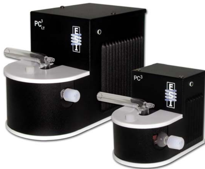
PC 3 -LT and PC 3

The PC 3 reduces the water vapour loading on the plasma resulting in enhance stability and performance. The spray chamber can incorporate any 6 mm nebulizer and is ideally suited to the PFA-ST Microflow nebulizer.