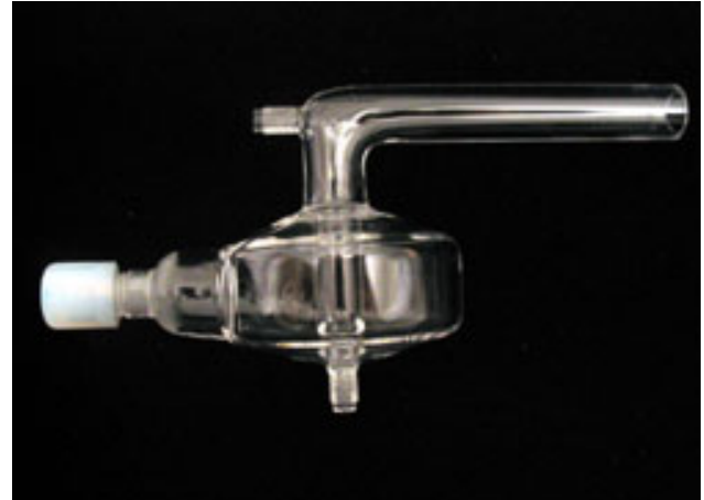
Quartz Cyclonic Spray Chamber

Aerosol enters second homogenization chamber, producing a very stable signal, ideal for isotope ratio analysis.