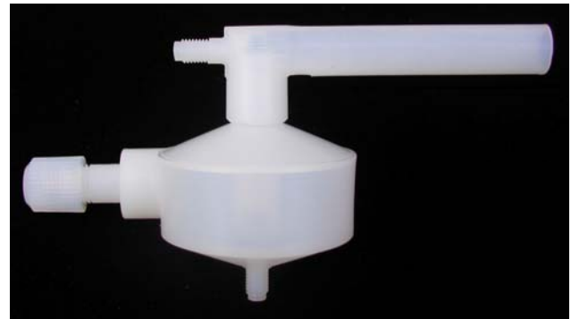
PFA Cyclonic Spray Chamber